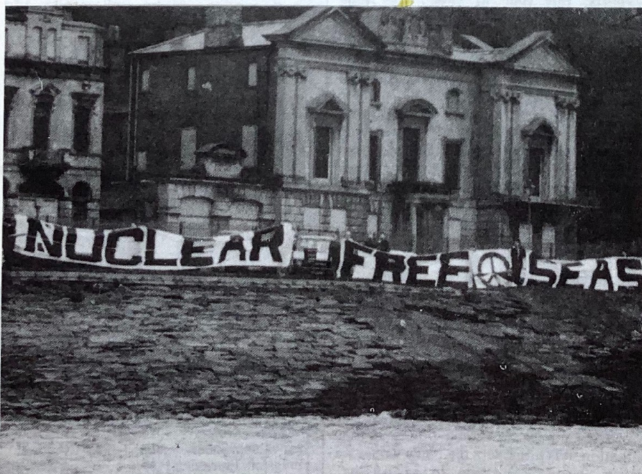
SEA ACTION – peace campaigners took to the boats when the frigate HMS Jupiter, which can carry nuclear weapons, visited Cardiff in January. They got close to the ship as it rounded Penarth head. See page 2

You can buy a programme to guarantee admission from the Greenhouse, 1 Trevelyan Terrace, Bangor (£1.50 or 75p each). Please send a large s.a.e. For more information please phone CND Cymru (0766) 831356.