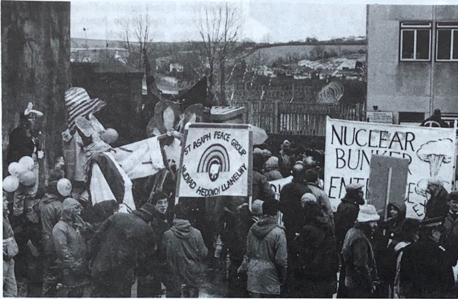
NO BUNKERS! Demonstration against the Carmarthen bunker in March 1986

Why does CND Cymru make such a fuss about bunkers? This is a question which was asked in Carmarthen, is asked in the Rhondda and presumably will be asked in Dinefwr and the Vale of Glamorgan.